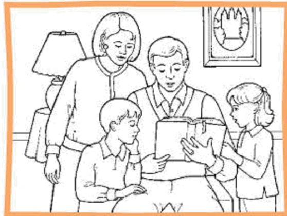
3. Heavenly Father asked special people to help me and guide me.