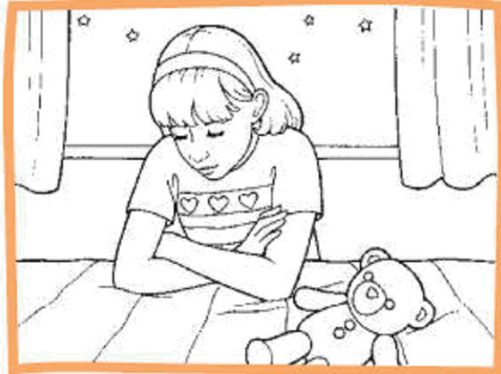
4. I can talk to Heavenly Father in prayer, and He will answer me.